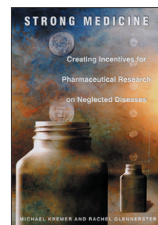
Strong Medicine: Creating Incentives for Pharmaceutical Research on Neglected Diseases

In its cloak of strong patents and secrecy, Strong Medicine also sets up an unnecessarily confrontational stand-off with those who argue for more open, collaborative approaches. The Gates Foundation and the G8 have been exploring these alternatives, following the recent proposal of a “Global Vaccine Enterprise” ( Science 2003; 300 : 2036–39) along the lines of the successful human genome project. The strongest setting for a purchase commitment for a complicated vaccine like HIV is likely to be as a fairly late, and small, part of a much larger package of measures, with the information revealed by earlier collaborative mechanisms used to set the terms of “contingent” purchase commitments. This would allow for more guidance on